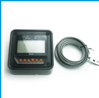
Remote meter MT50