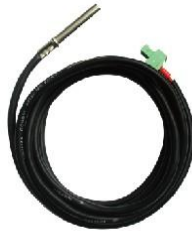
Remote temperature sensor RTS300R47K3.81A