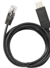
PC communication cable CC-USB-RS485-150U